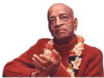
His Divine Grace A.C. Bhaktivedanta Swami Prabhupada Founder Acharya: ISKCON